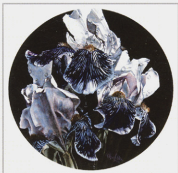
VIVIAN THIERFELDER Iris Cameo 1983 watercolour on paper $3,000/3,500