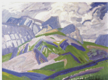
ILLINGWORTH HOLEY KERR Grey Day, Kananaskis 1968 oil on canvas board $1,750/2,250