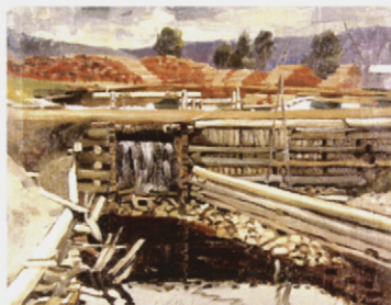
LLEWELYN PETLEY-JONES Alberta Mill 1930 oil on canvas $1,500/2,000